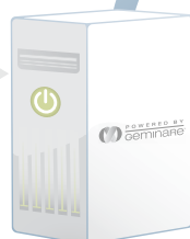
Replicated Server at Geminare