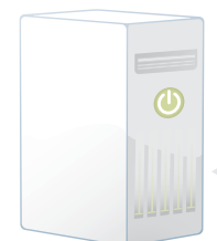
Client Production server

Real-time data replication ensures that, in the case of an unplanned outage, users are instantly redirected to a mirror version of their fileserver, which sits at a secure data center. Business continues as usual.